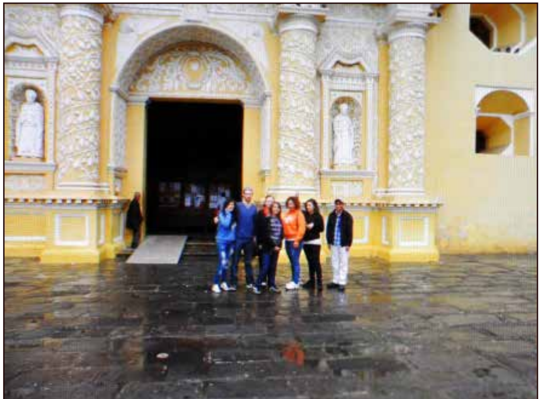
Daneel and Adat Israel members visiting La Merced Church in Antigua, Guatemala