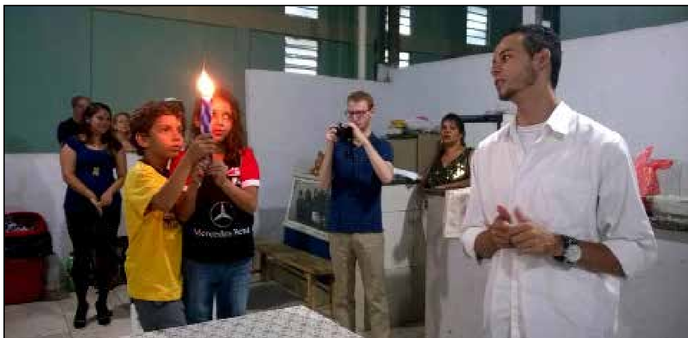
The Yad Eliyahu Community of Goiania, Goiás, in Brazil, celebrating Havdalah in 2015